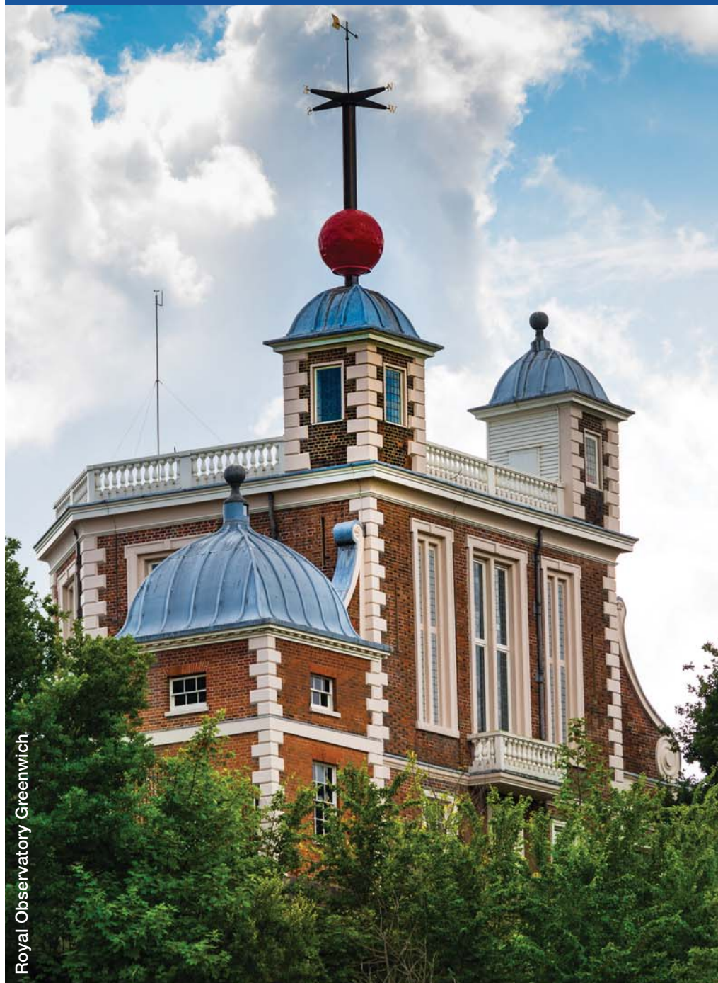
Royal Observatory Greenwich

Price based on twin share. Minimum numbers required. Normal booking conditions apply.